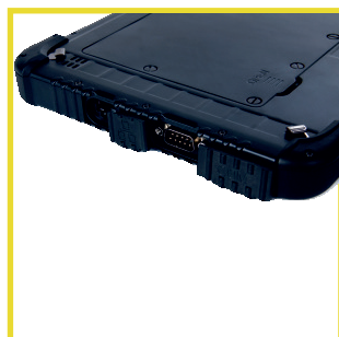
Vielfältige Schnittstellen Rich I/O options