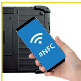
Standard NFC Reader Standard NFC reader