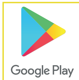
Google Android 12 GMS zertifiziert Google Android 12 GMS certified